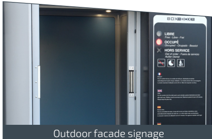
Outdoor facade signage