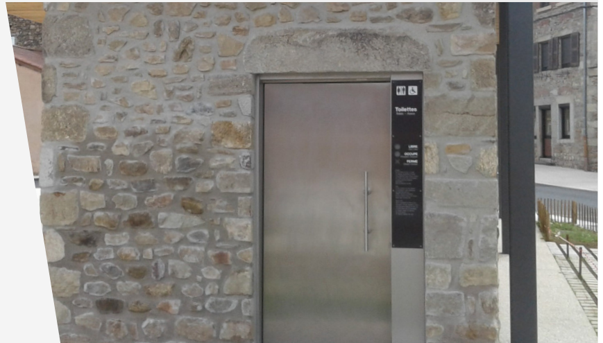
BOXinBOX integrable toilets