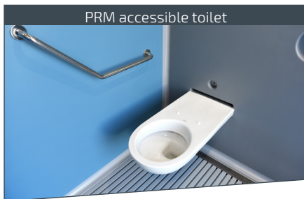
PRM accessible toilet