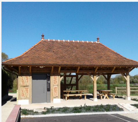
Can be integrated into new masonry