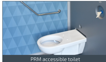
PRM accessible toilet