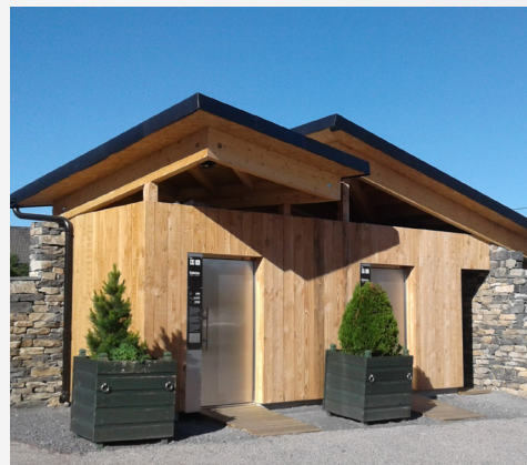
Can be integrated into a new wooden structure