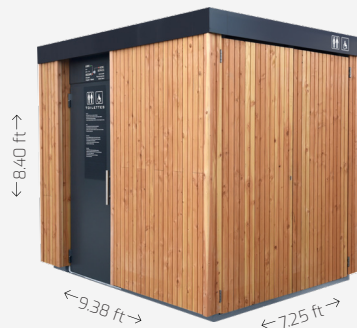
Vertical natural wood cladding