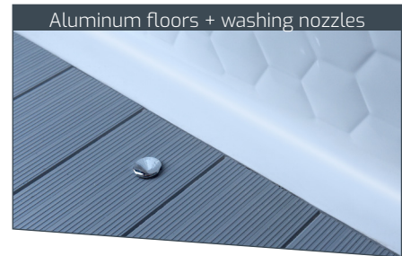
Aluminum floors + washing nozzles