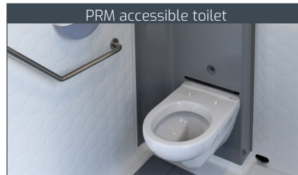
PRM accessible toilet