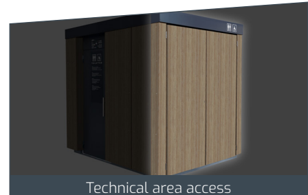
Technical area access