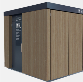
Vertical composite wood cladding