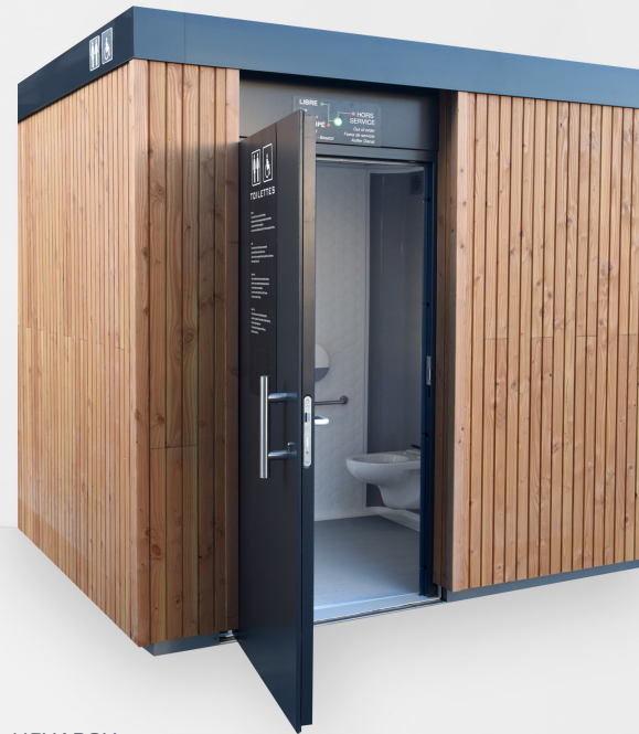
HEXABOX natural wood cladding