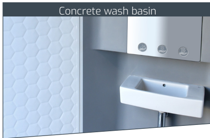
Concrete wash basin